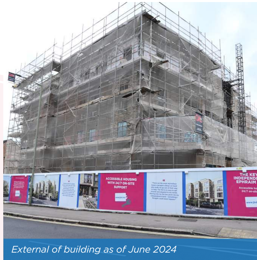
External of building as of June 2024