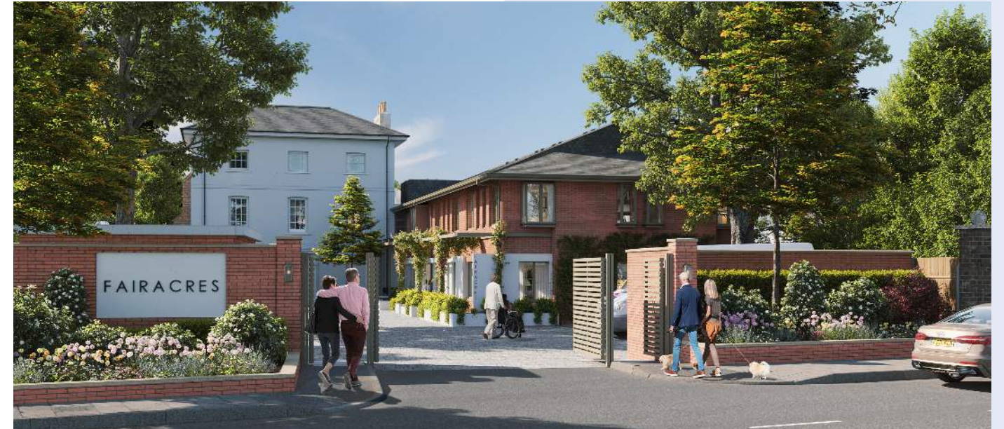
Artist impression of new entrance to Fairacres

In March 2024, following a series of successful pre-application meetings, JBD submitted a planning application to the London Borough of Barnet to redevelop our oldest building, Fairacres, in East Finchley.