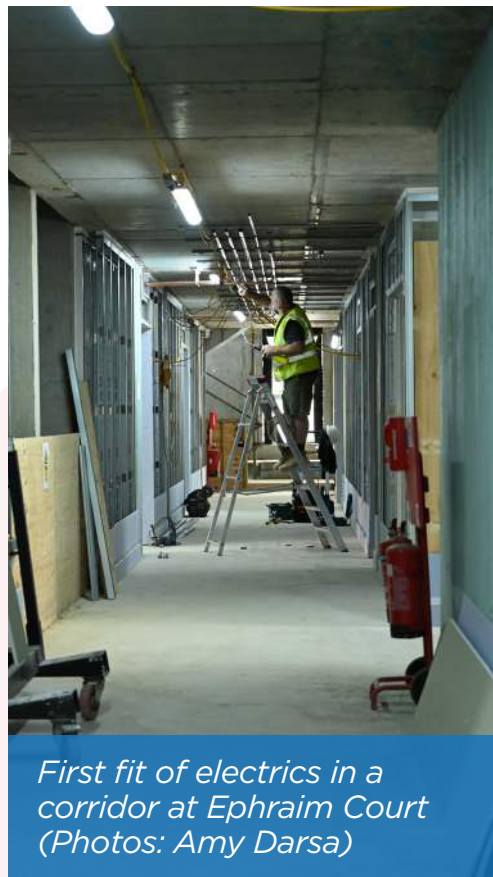
First fit of electrics in a corridor at Ephraim Court

Construction continues apace at our newest development, Ephraim Court, in Mill Hill. This summer the building will be watertight, with brickwork, roofing and window fitting complete. New accessible and adaptable kitchens have been designed and are currently being ordered, and the final decisions on interior design are being made. The contractors are due to complete all work at the end of April 2025, following furnishing we will then be opening the doors in Summer 2025.